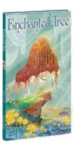
Enchanted Tree 魔丽树