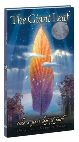
The Giant Leaf 梦中的巨叶