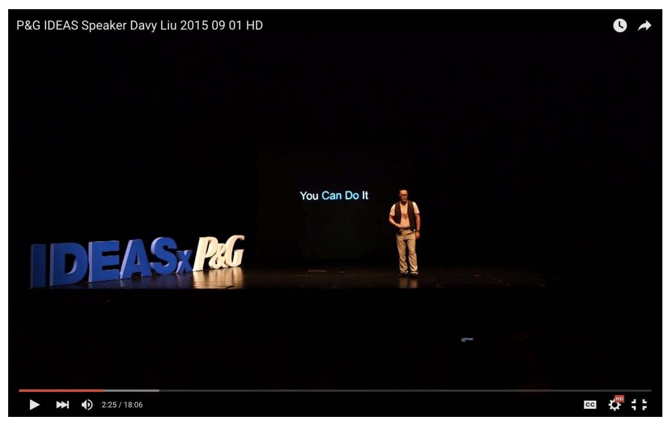
"You Kendu It" - IDEASxP&G, September 2015 | IDEASx宝洁, 2015年9月 https://www.youtube.com/watch?v=_n3DFuijVOk